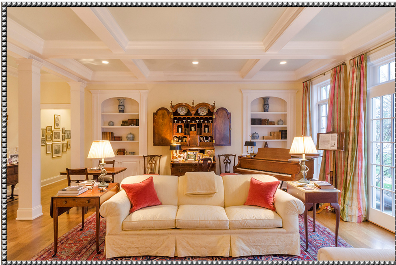
Coffered Ceilings and Palladian Openings