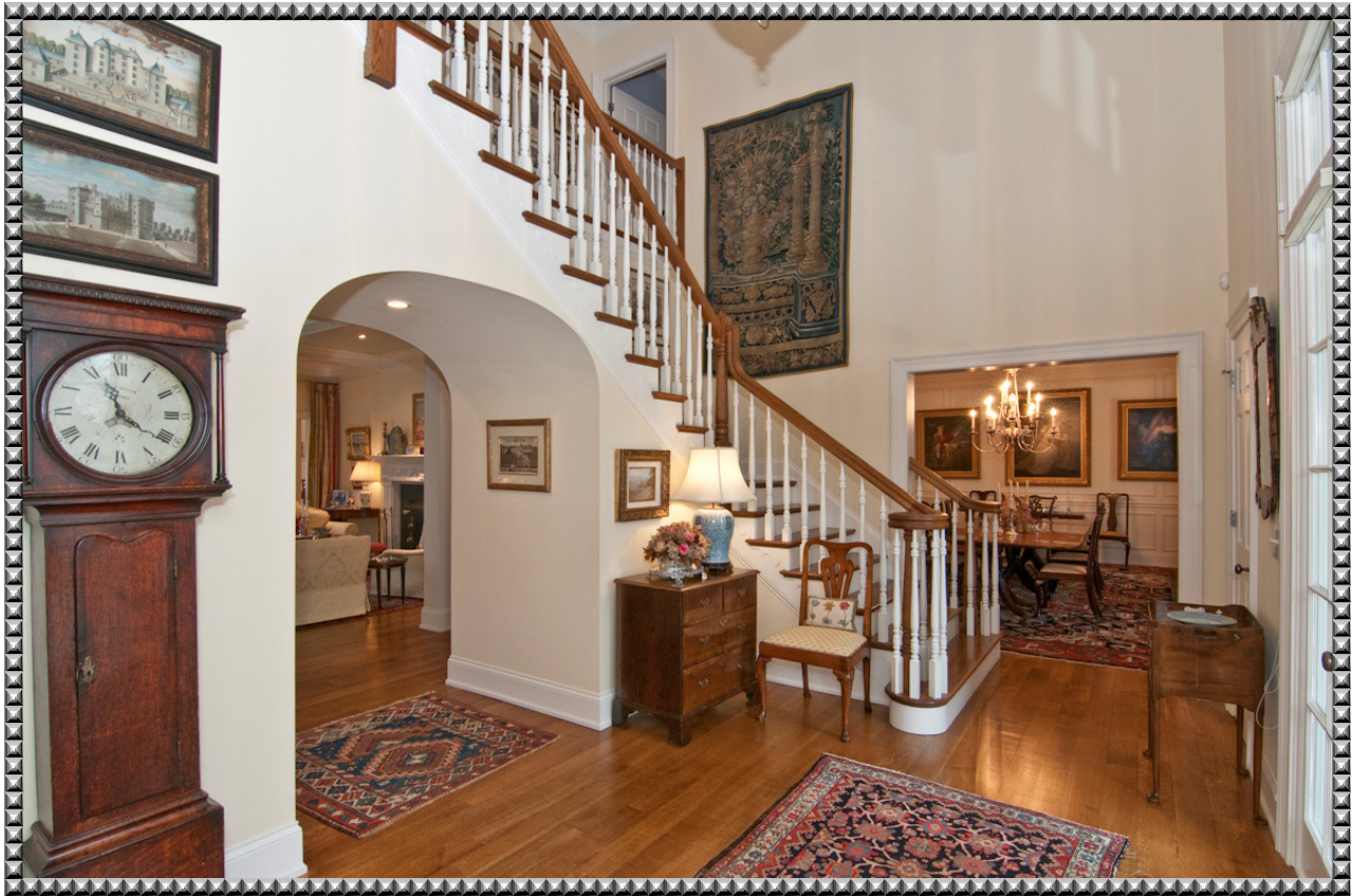
Design features include arched openings, turned staircase, & wide planked maple flooring