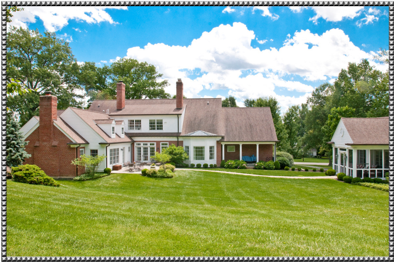
Newer Guest Cottage