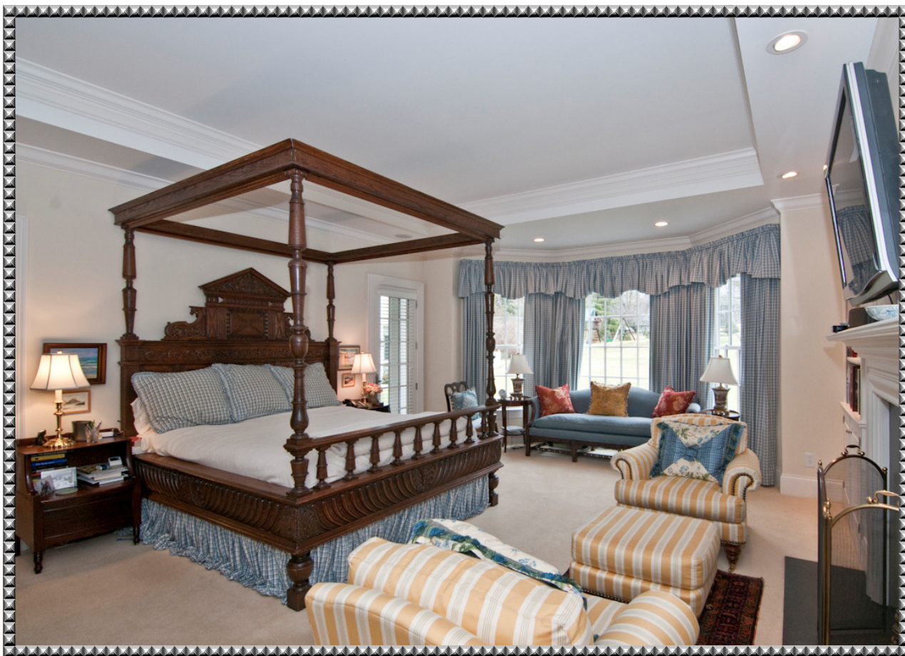
Log Fireplace and Bay