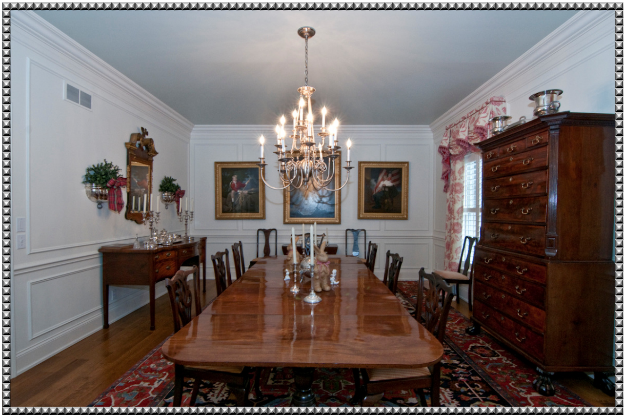
The Most Beautiful Dining!