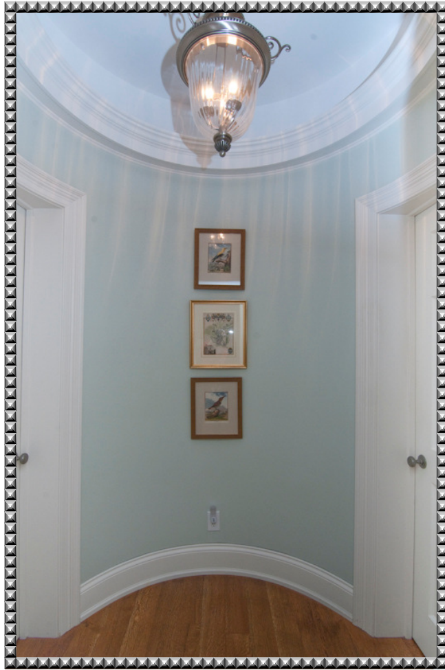
Domed Entry to Master