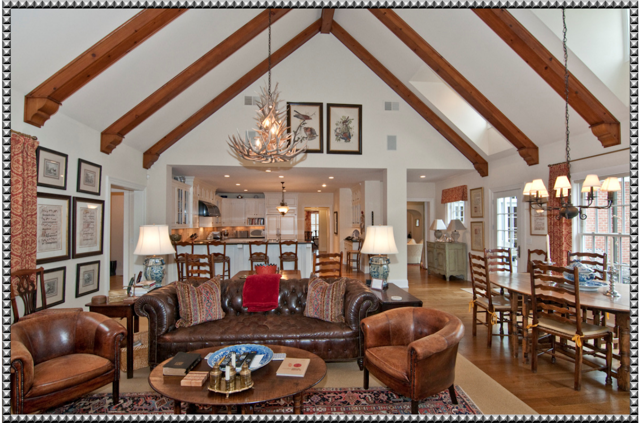
Expansive Family Spaces!