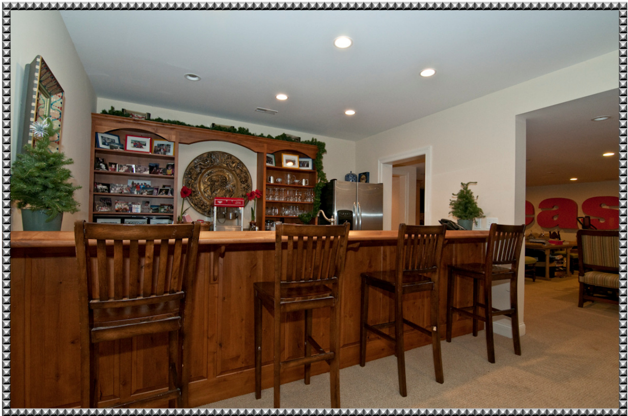
Pub Room Retreat