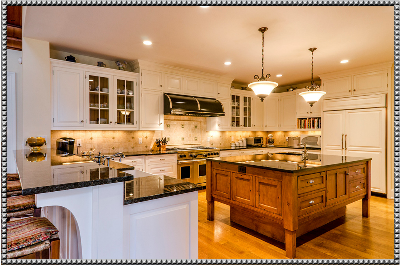
The Chef's KD & Steele Dream