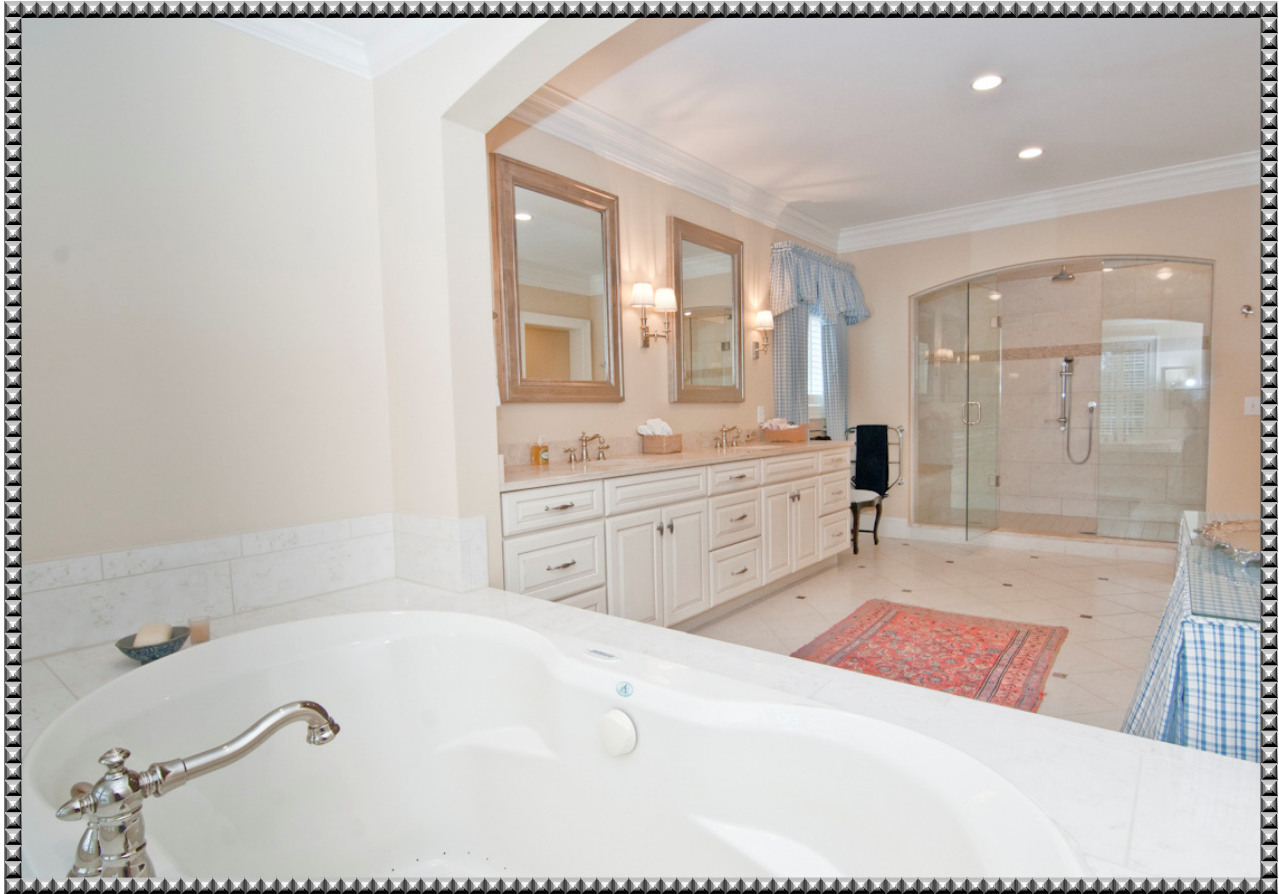
Space for Two!