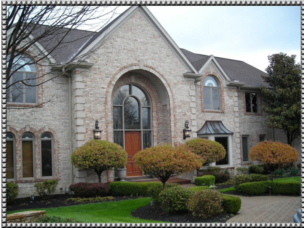
THE ESTATES of CATERBURY WOODS 698 Canterbury Drive

At the pinnacle on over two glorious acres of view property, this Ashley built Manor Home is the piece de resistance! Offering a reported 10,262 square feet the architectural detail and dramatic open spaces combine the best of European elegance with the livable advanced state of the art technology we covet today. Enter the circular drive to all the elegance of a volume space accented by sweeping curved staircase, limestone flooring, and crystal chandeliers! From opulent Master Quarters, two story Library, expansive Kitchen-Hearth Room & Four Seasons Room to stocked Pond this home is in everyway the Manor!