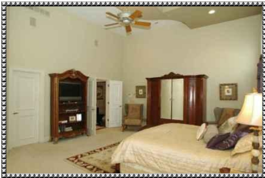
Remarkable Master Quarters