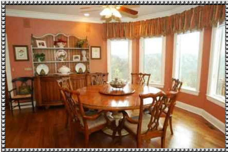
Views abound in Hearth Room and Four Seasons Room