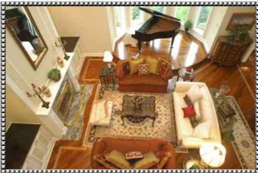
Crystal Limestone and Polished Inlaid Hardwood!