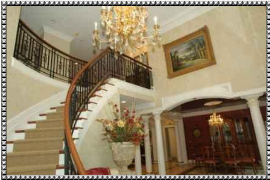
Exquisite European Entry