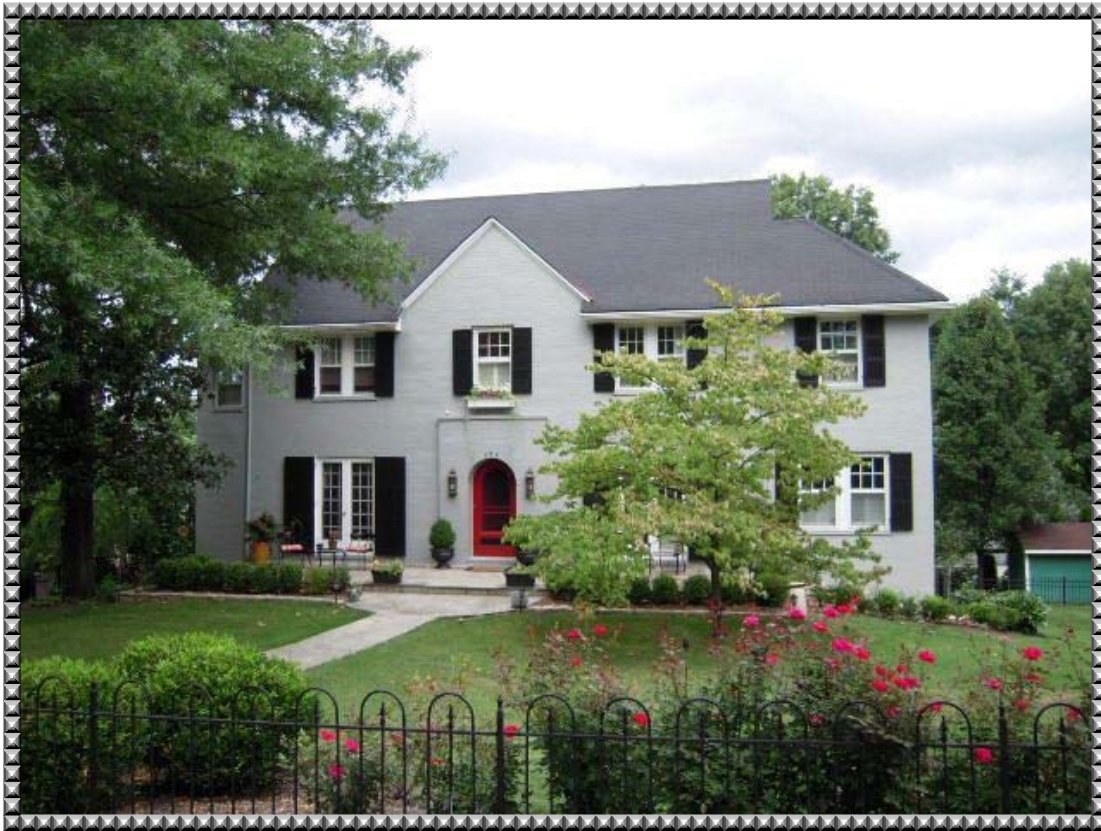
Sweeping Lawns & French Door Terraces