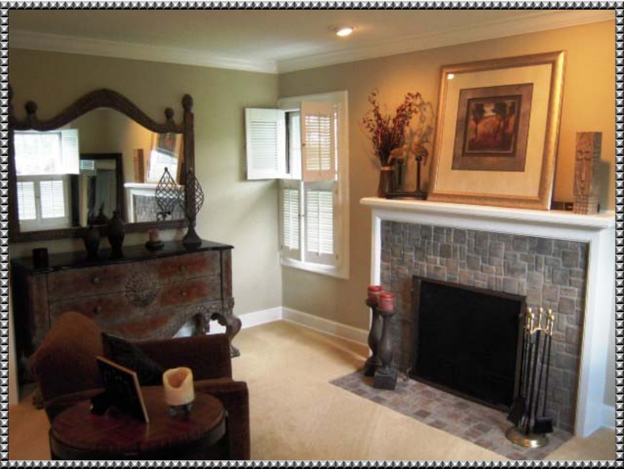
Master Sitting & Bath Suite