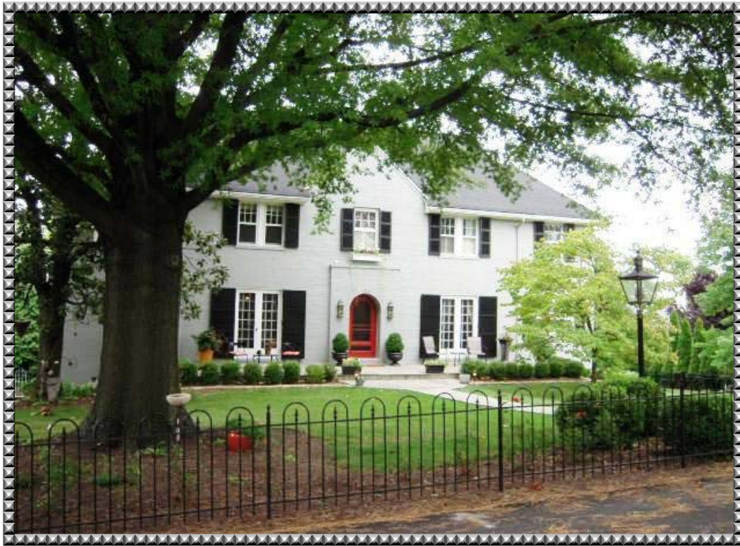
Sweeping Lawns & French Door Terraces