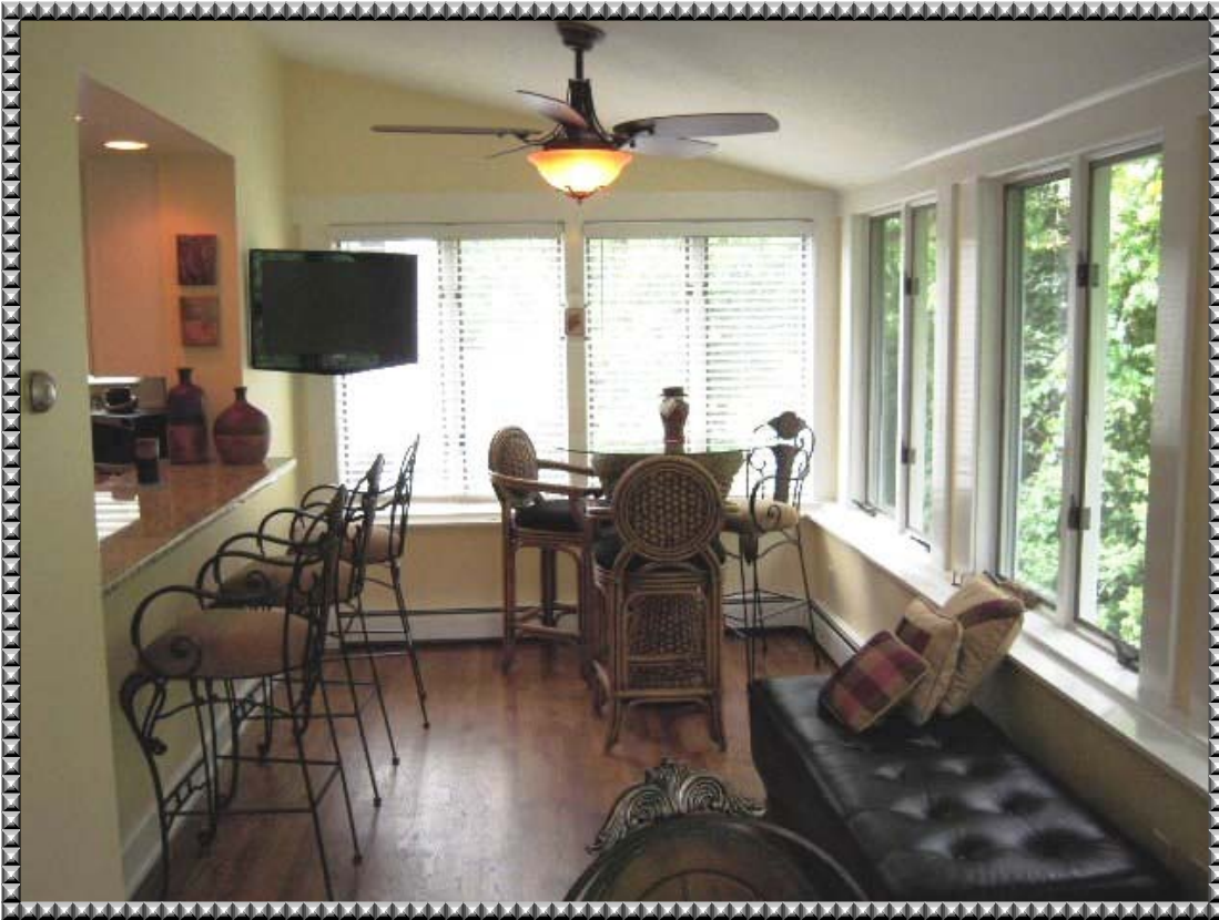
Solarium Kitchen Hearth Room