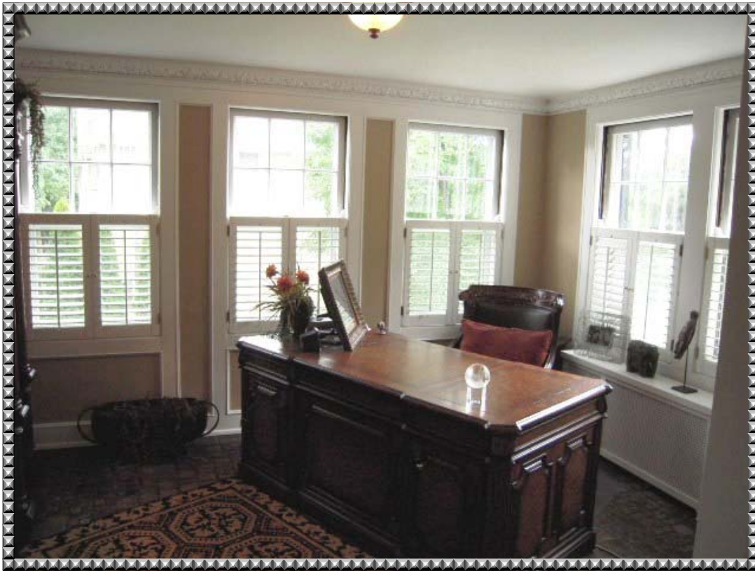
A Restoration of Note