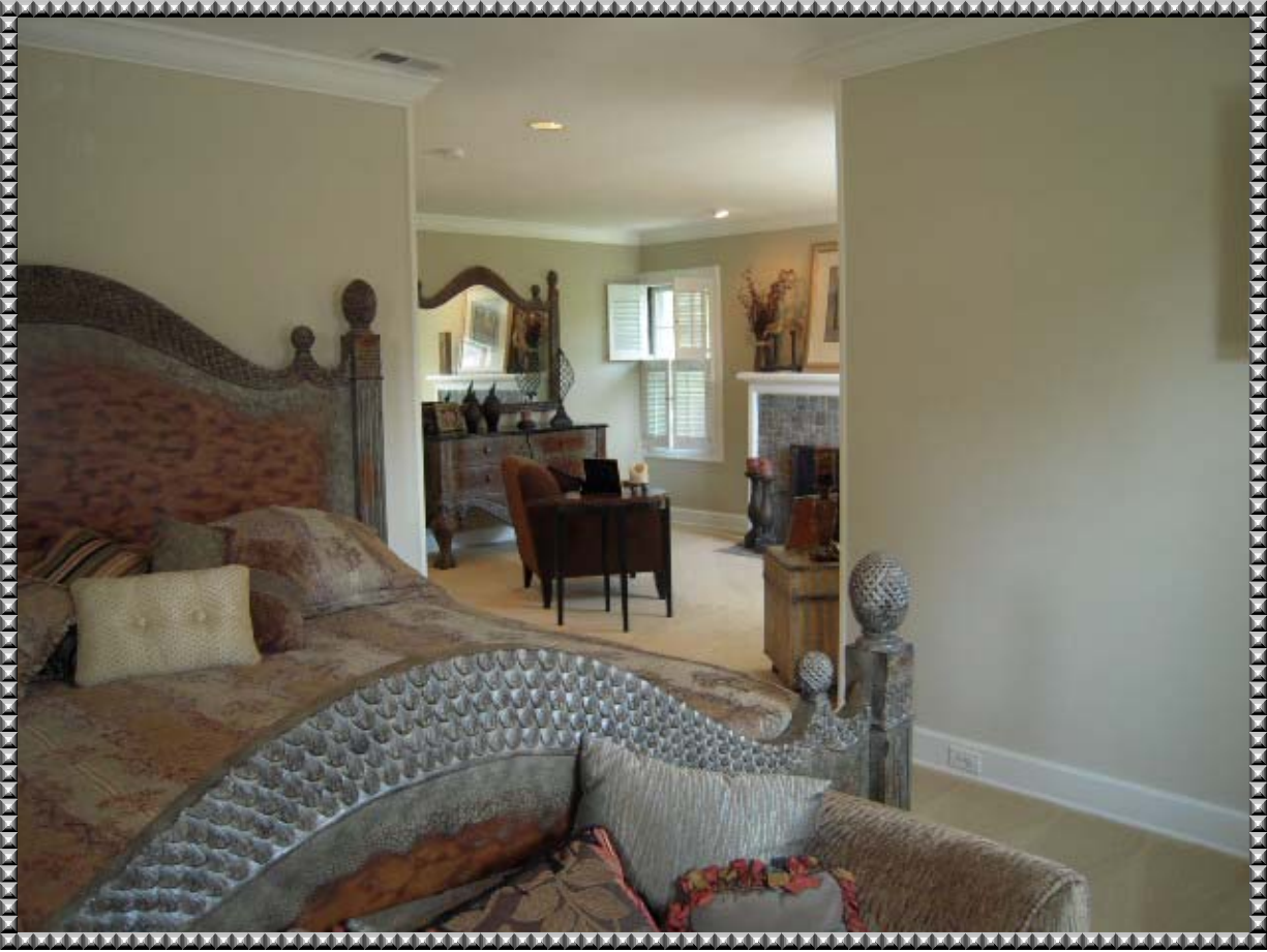
Master Sitting & Bath Suite