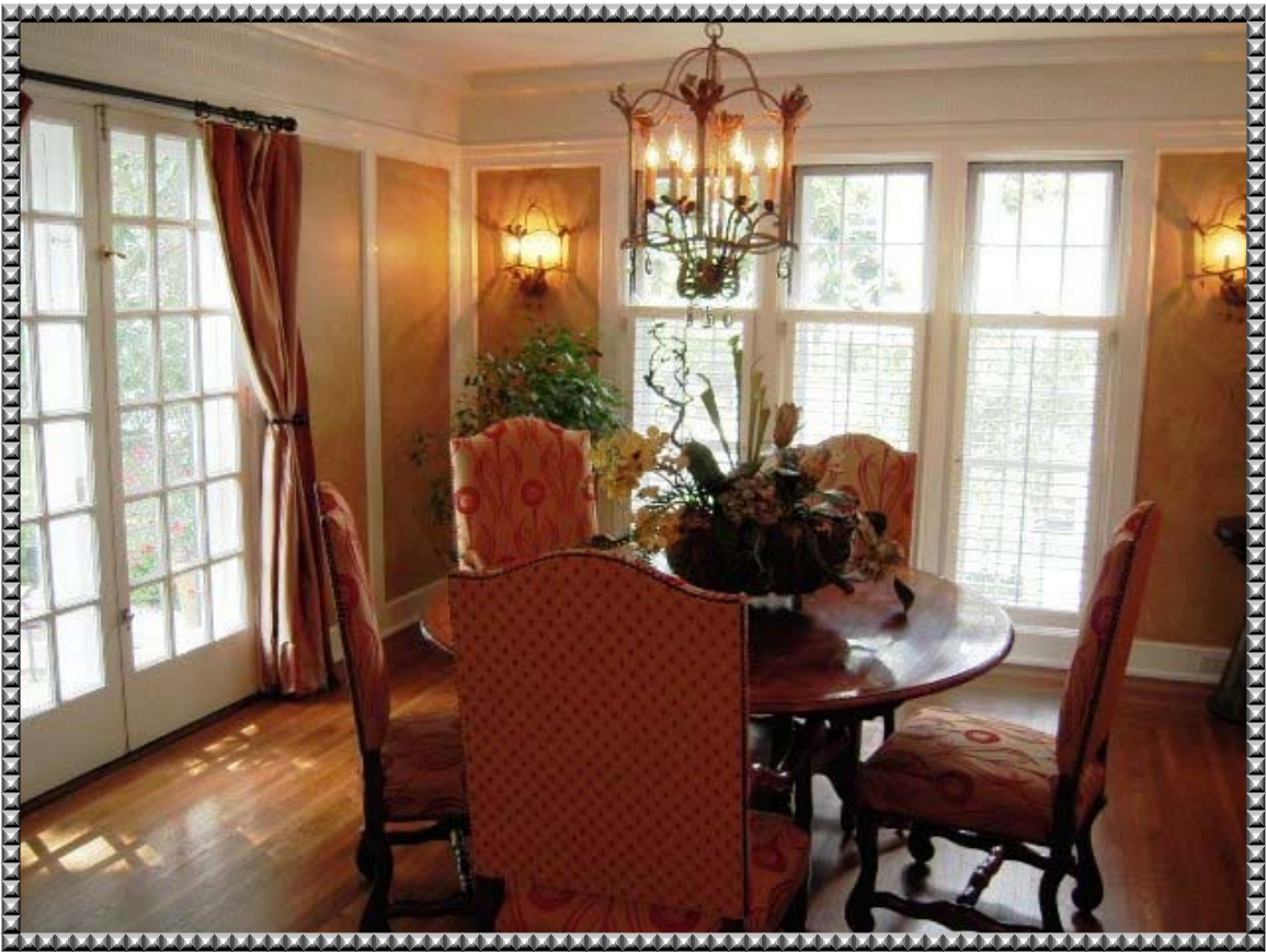
Polished Hardwood, Millwork Superlatives, & Candle Light.