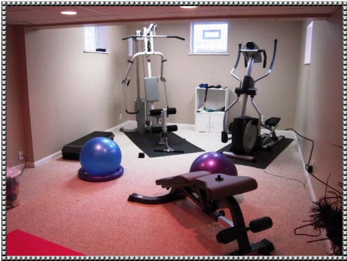
Fitness & Wine Cellar