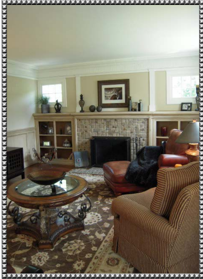
Collectable Rookwood Fireplaces