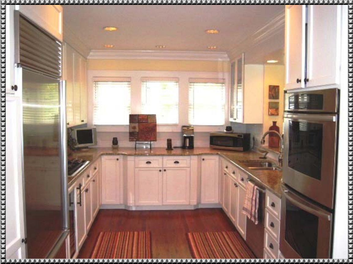
Designer Kitchen from Granite To Stainless