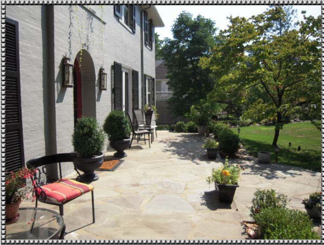
Sweeping Lawns & French Door Terraces