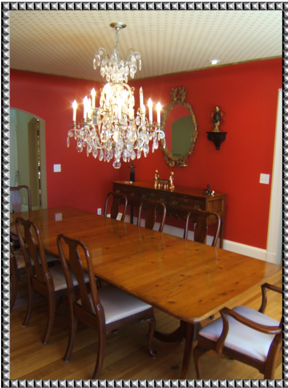
All About Your Guests & Entertainment!