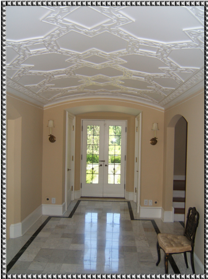
Entrance Hall Gallery Front to Rear with Barrel Vaulted Ceilings!