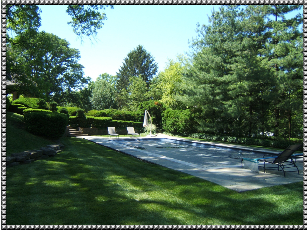
Magnificent Pool Privacy!