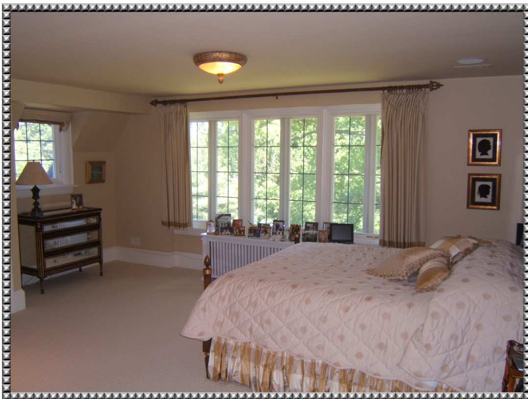
Comforts of The Ritz in Your Master Suite!