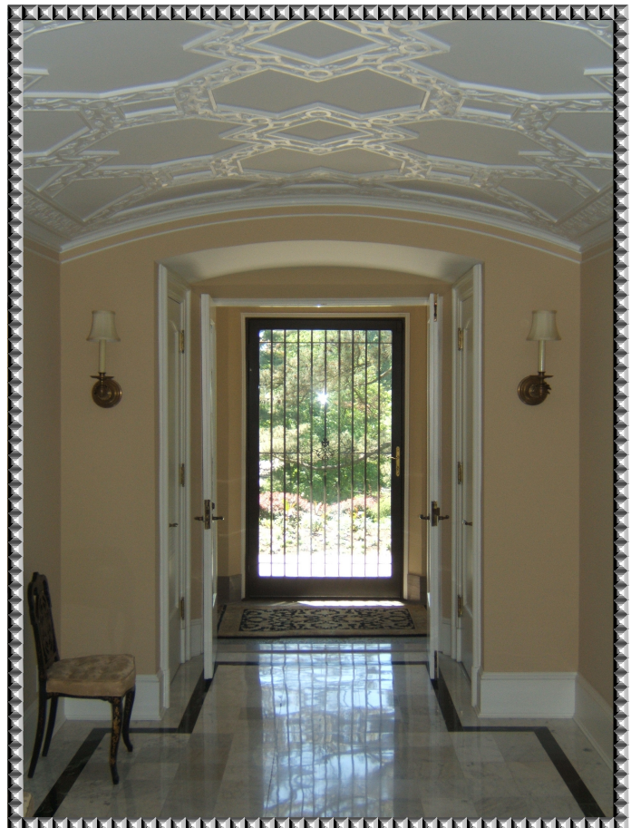
Polished Marble Brilliance!