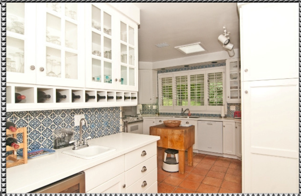
Bar with wine cellar opens to kitchen and dining