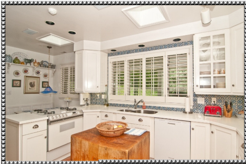
Subtle Euro Styling from Terracotta floor to Delft backsplash and notable pewter shell accents