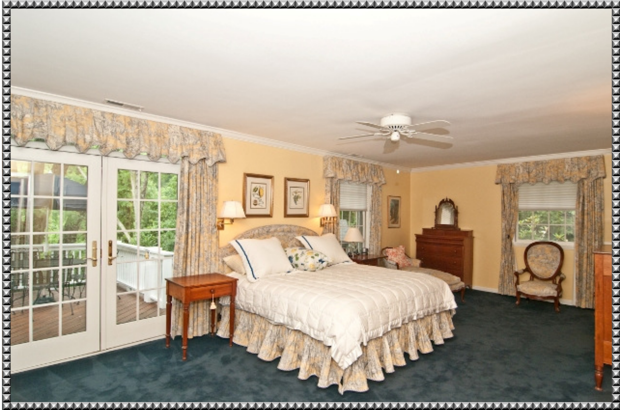
Master Suite on Main Level opens to Terraces & Newer Master Bath with Steam & Jacuzzi