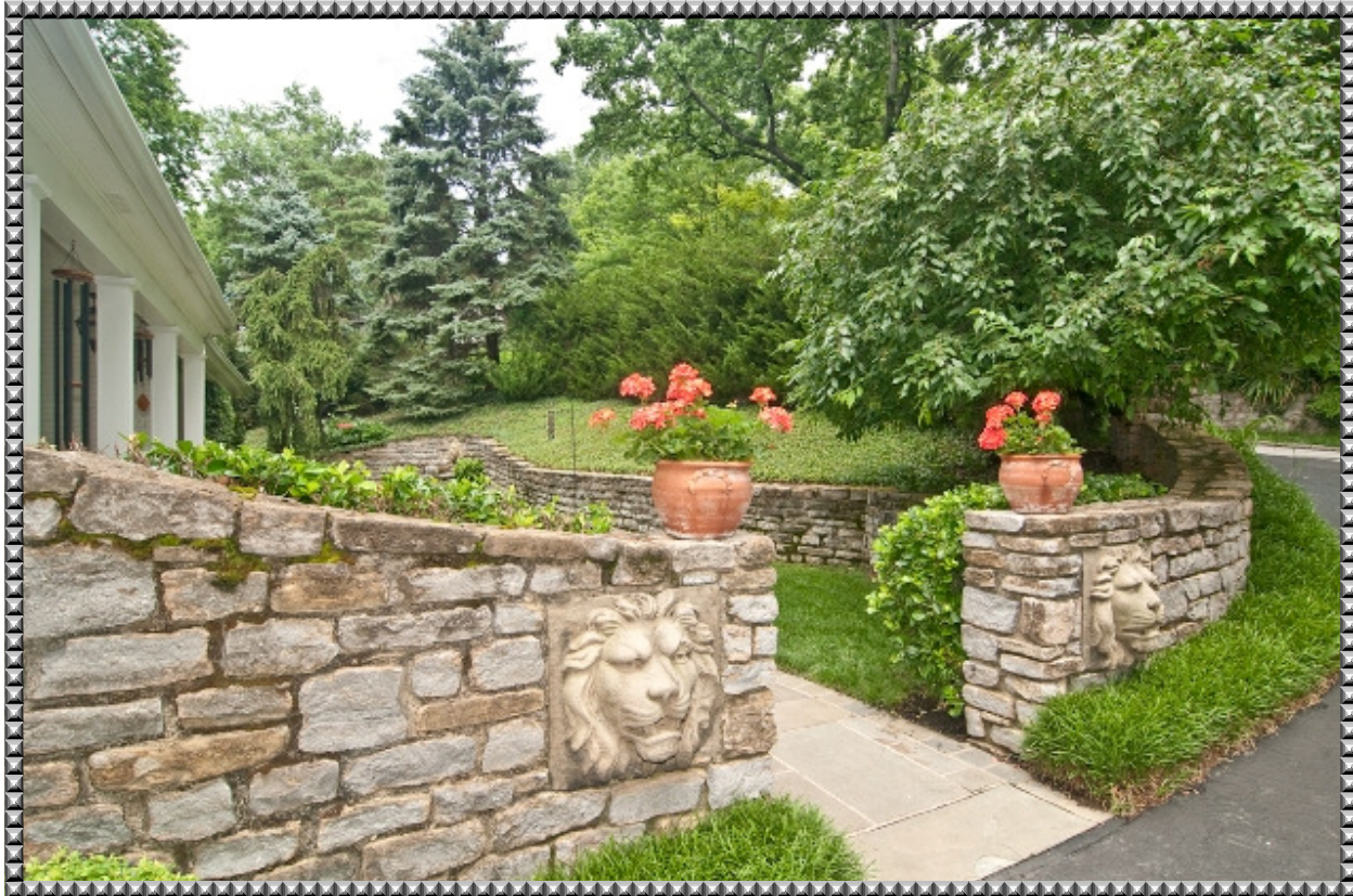
Lyon's Gate Gardens