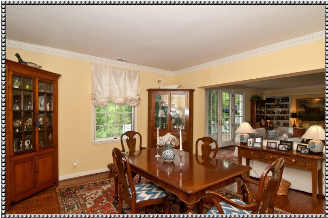
Opening to Terraces Great Room... A setting for memorable dining pleasures