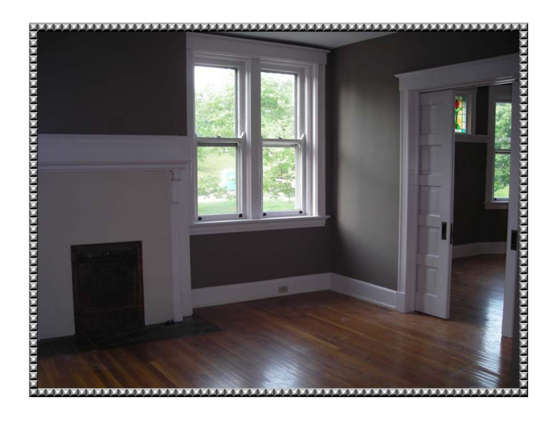
Polished, Bright & Open Spaces!