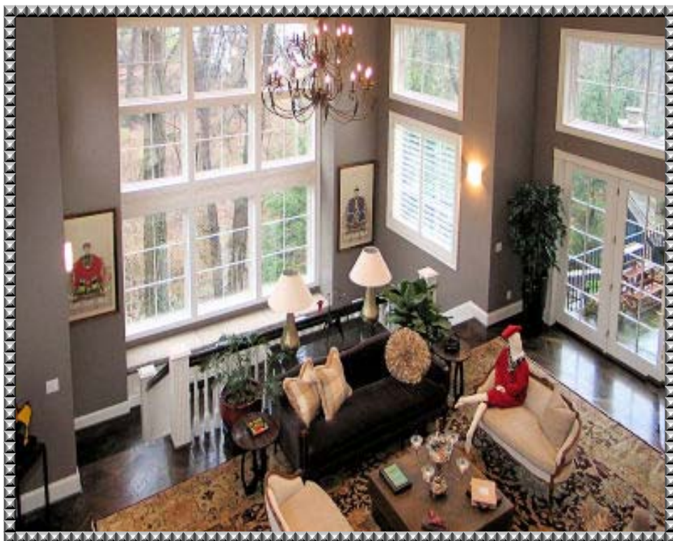
Expansive Volume Living Spaces!