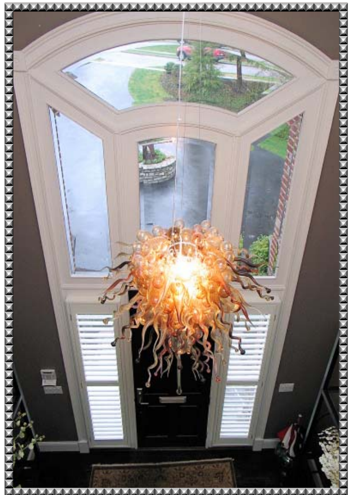
Light Filled Entry of Note!