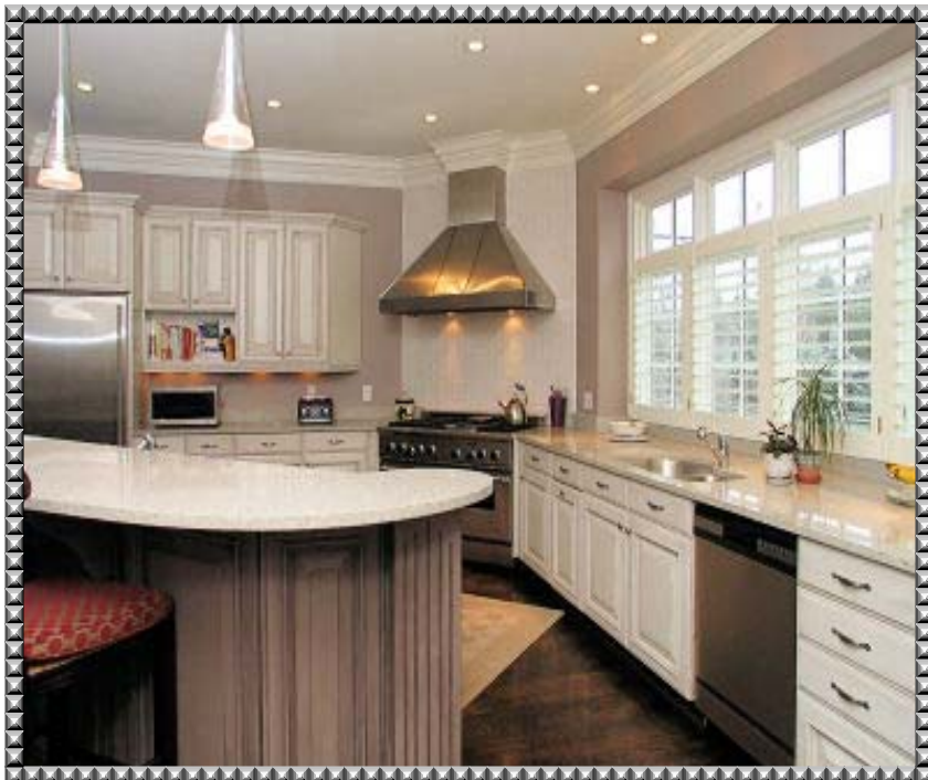
Gourmet Chef's Kitchen!