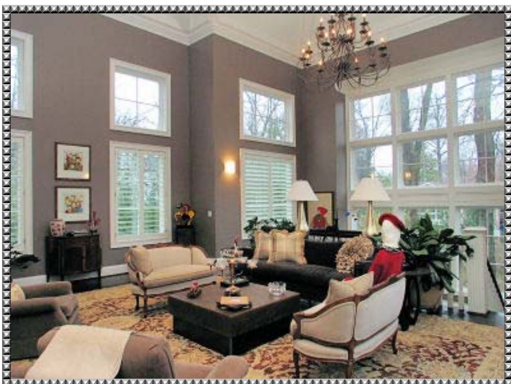
Elegance and Comfort