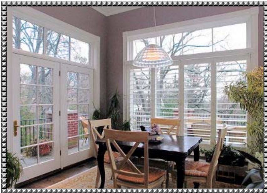
Private Outdoor Terraces