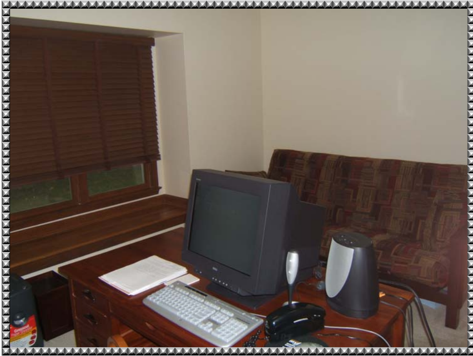
Working Office on Main Level!