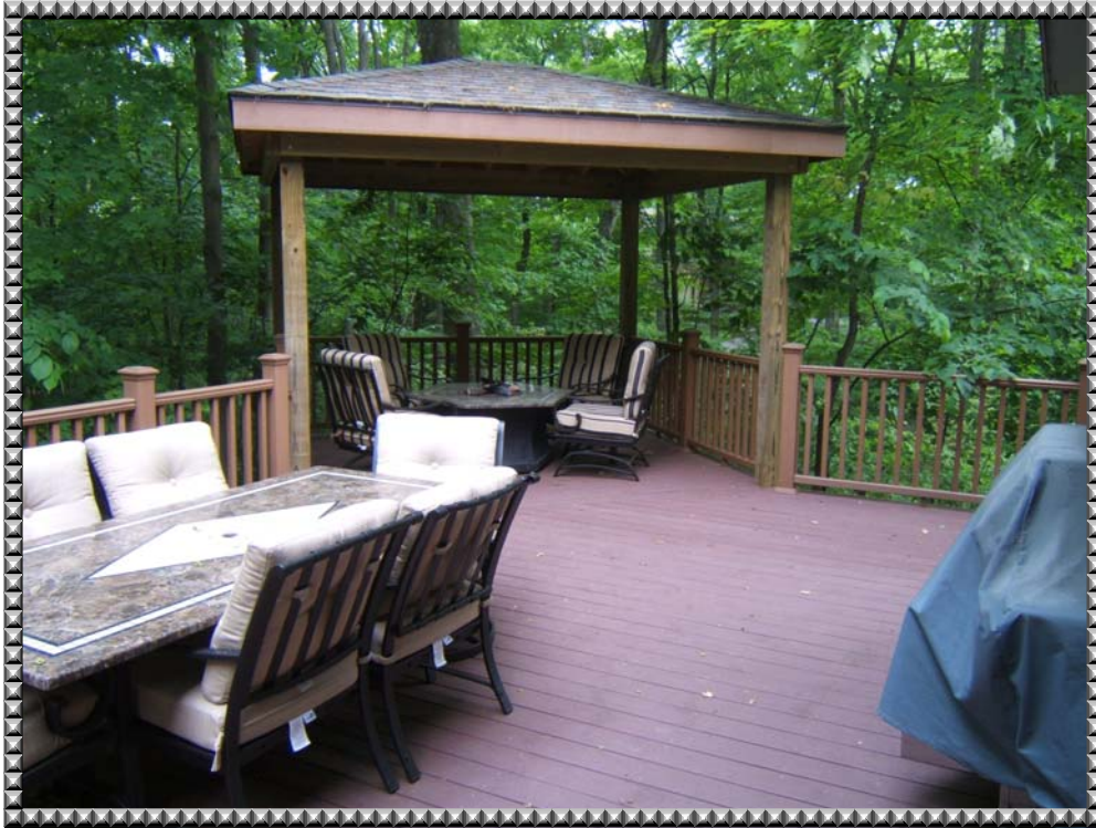
Green Spaces Seclusion!