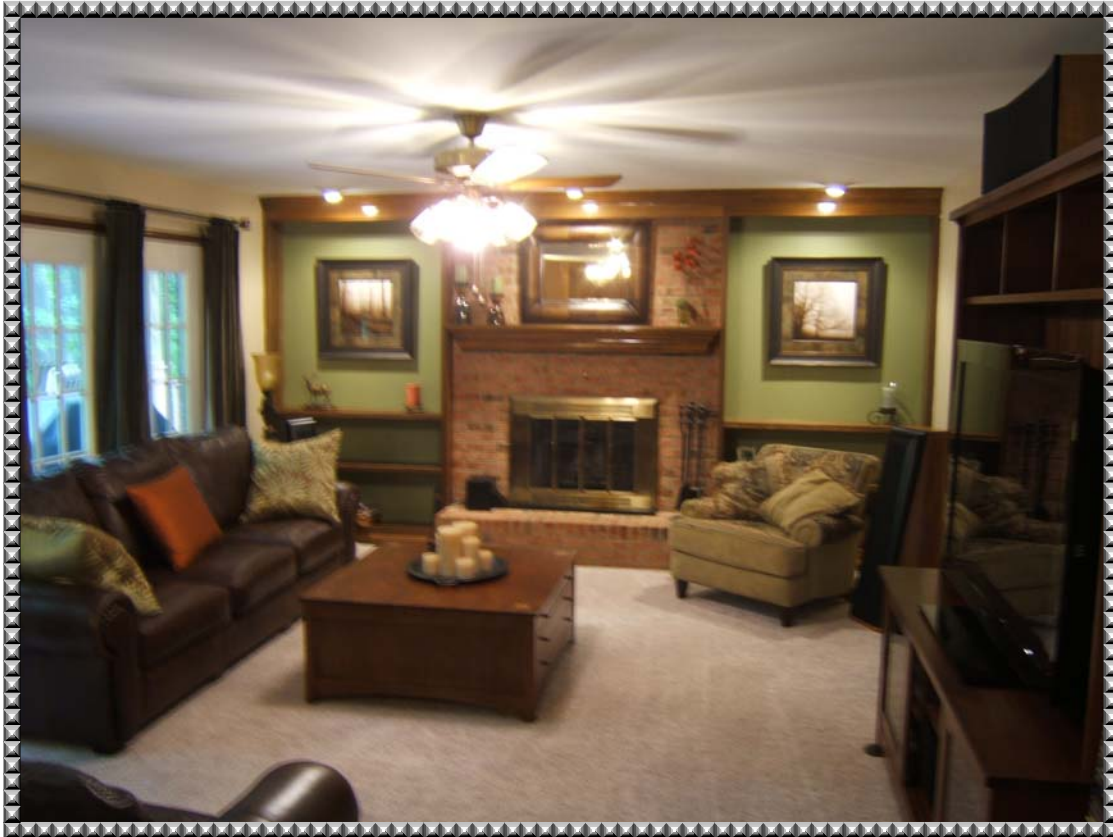
Hearth Room @ Kitchen!