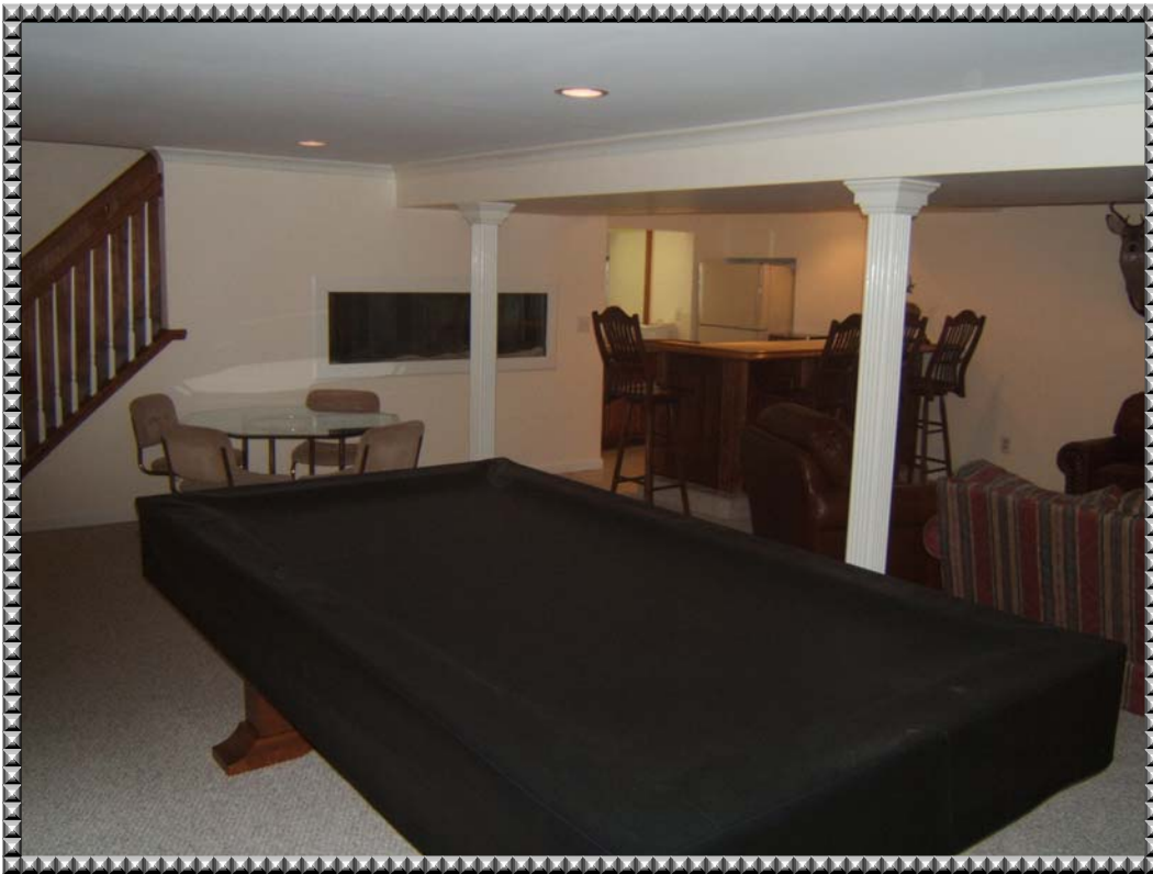
Game Room...Entertainment & Wine Bar!