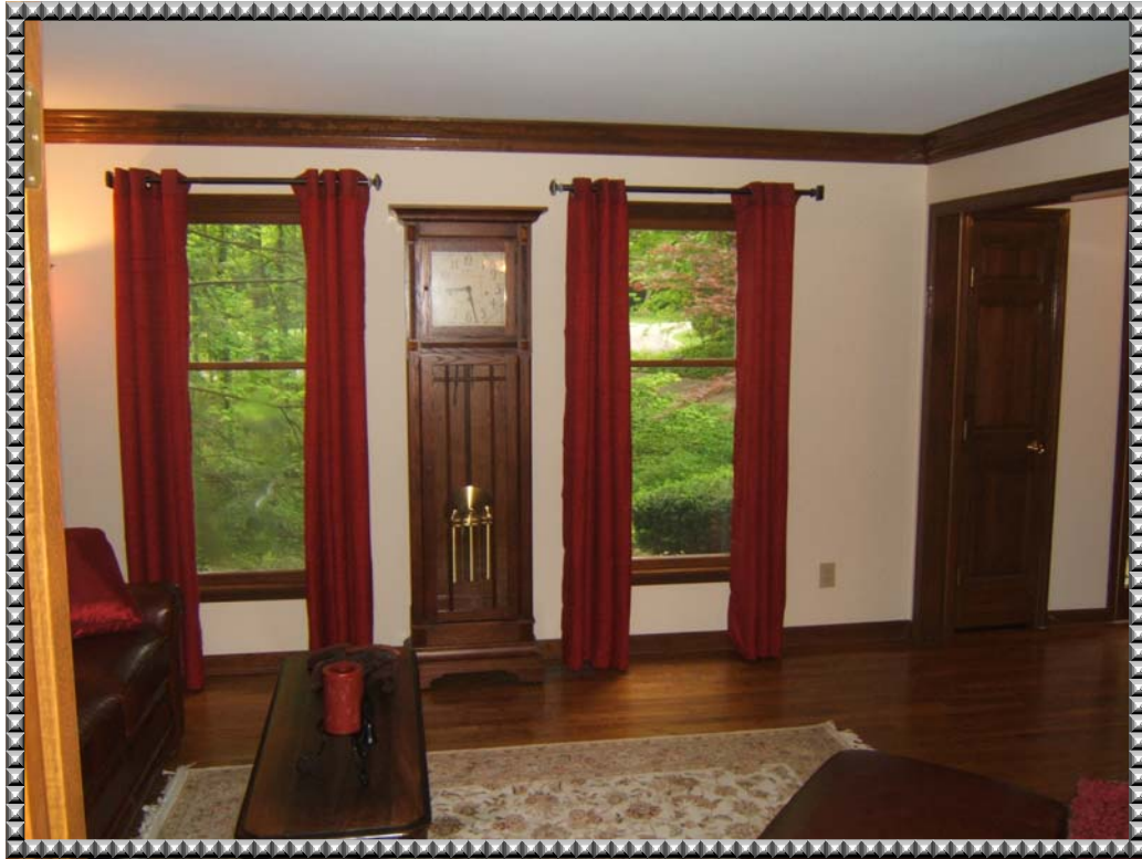
Warmth and Substance!