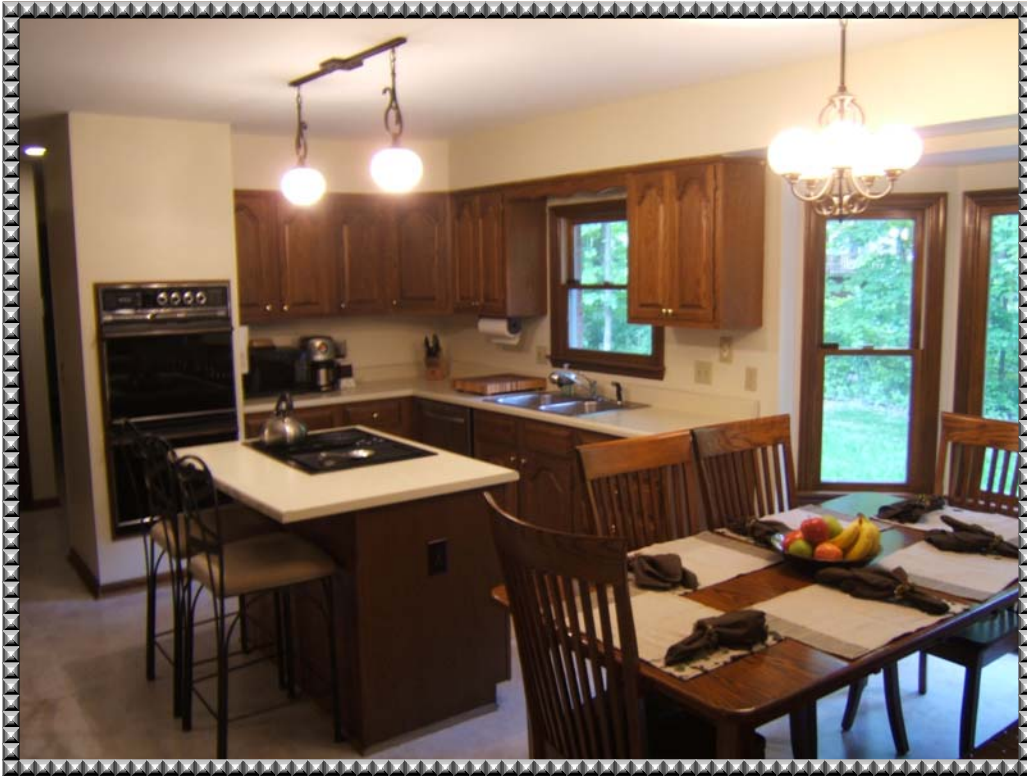
Day Dining & Island Cooking!