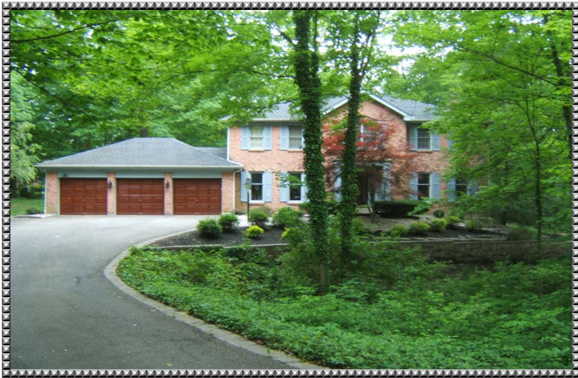
5963 Shallow Creek Drive

A WORLD OF ITS OWN...MINUTES TO ANYWHERE