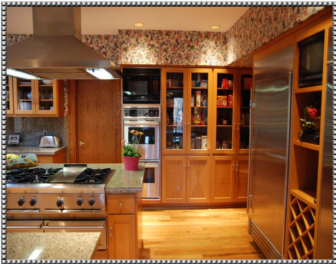
Chef's World Class Kitchen