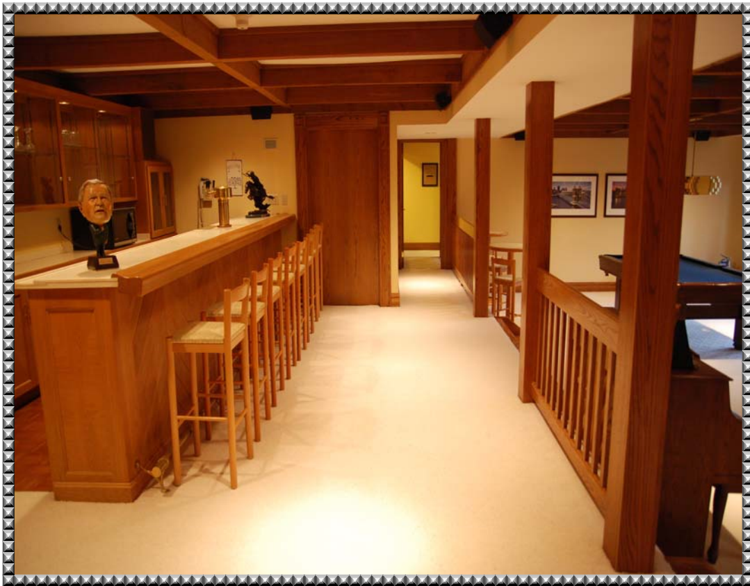
Walkout Recreation Opens to Lakes