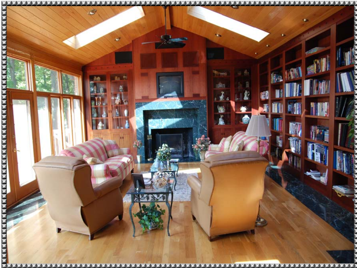
African Purple Mahogany Library