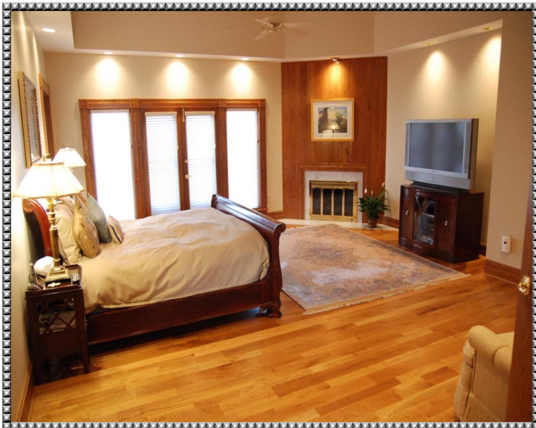
The Master Of All Masters