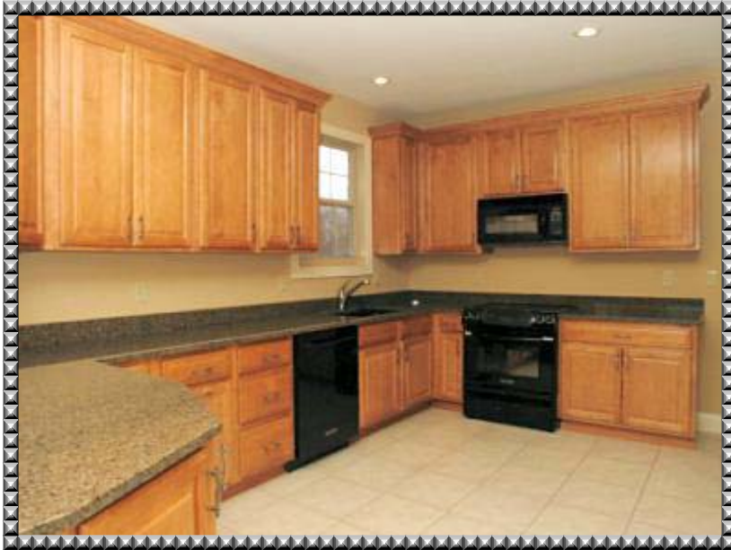
Exceptional Maple Cabinetry!