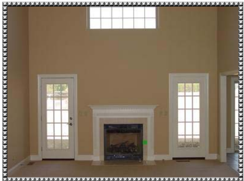
Soaring Great Room!