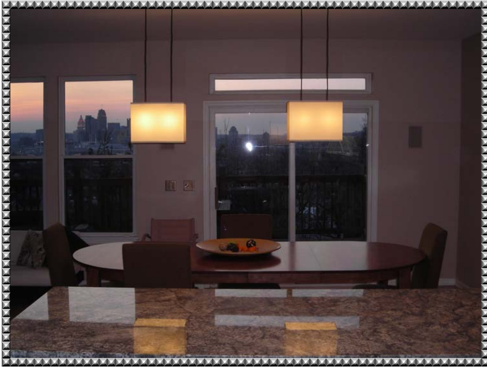
Dining Over the World!