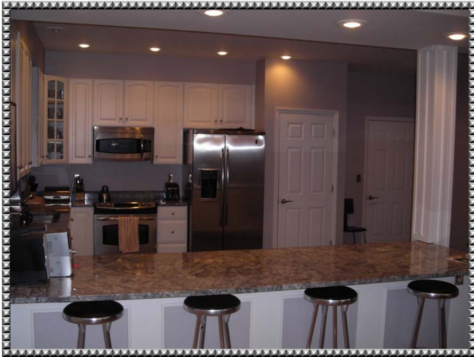
Granite & Stainless